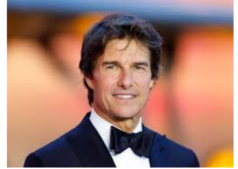
Tom Cruise, movie star