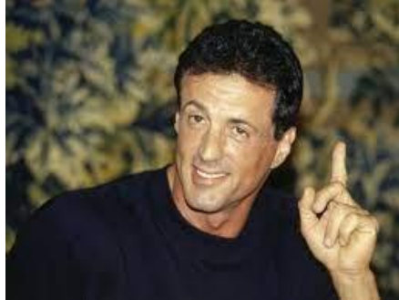
Sylvester Stallone, movie star