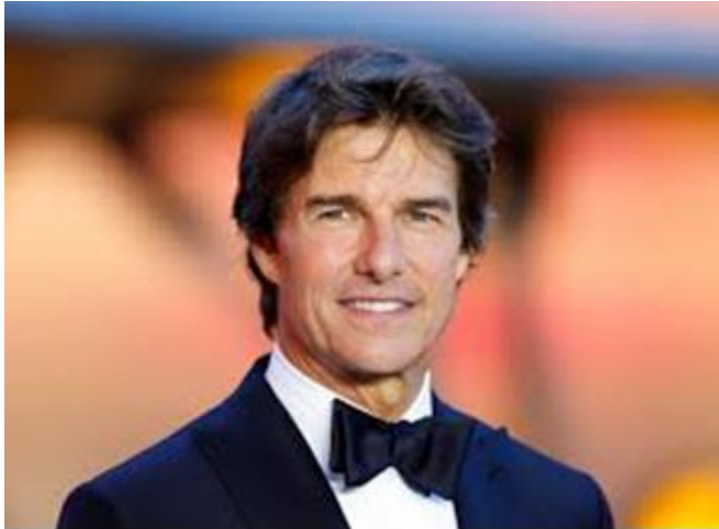
Tom Cruise, movie star