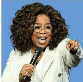
Oprah Winfrey, talk show host