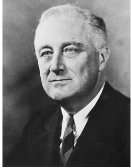
Franklin Roosevelt, US president