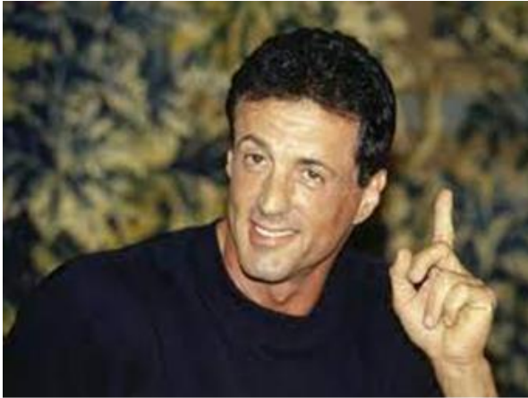
Sylvester Stallone, movie star