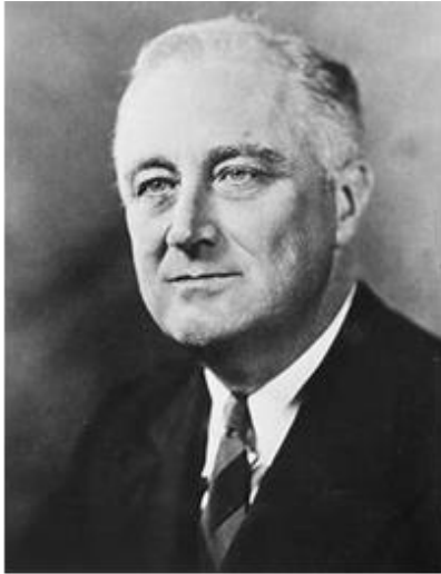
Franklin Roosevelt, US president