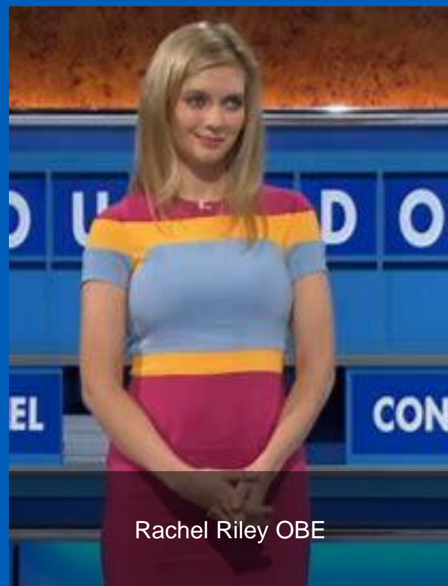
Rachel Riley OBE