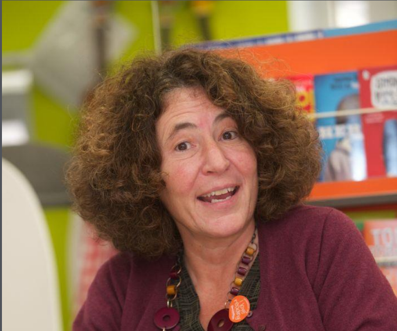
Francesca Simon OBE