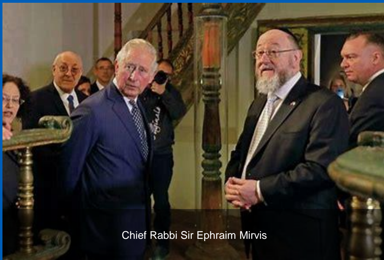
Chief Rabbi Sir Ephraim Mirvis