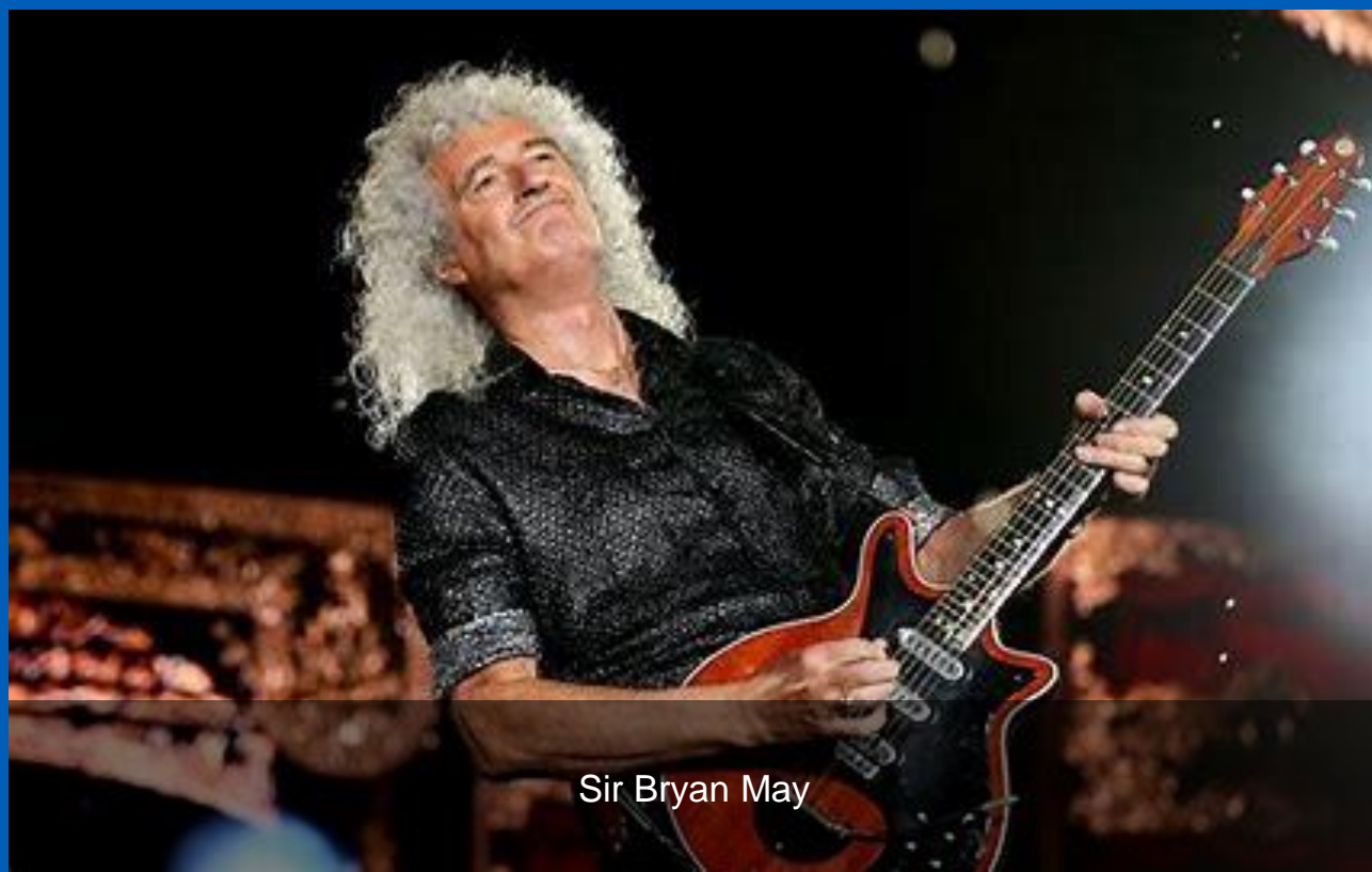
Sir Bryan May