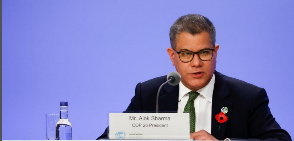
Right Honourable Sir Alok Sharma, MP